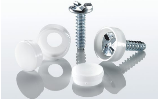
The Security Lock consists of three components: screw, washer and seal.